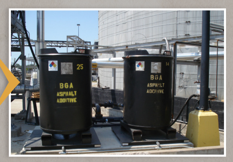
Two scales are required (one for each tote).

Scales are typically Mettler Toledo VLC floor scales (5,000 lb capacity) .